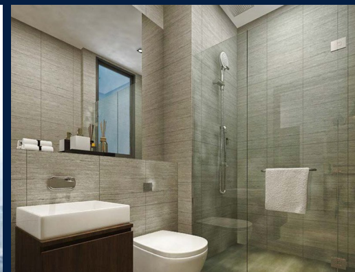
1 Bedroom + Study Penthouse